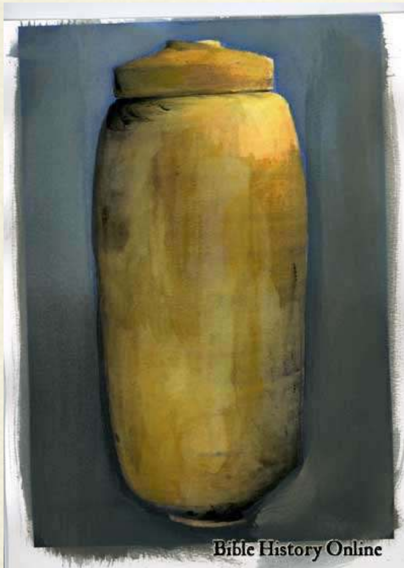
Bible History Online