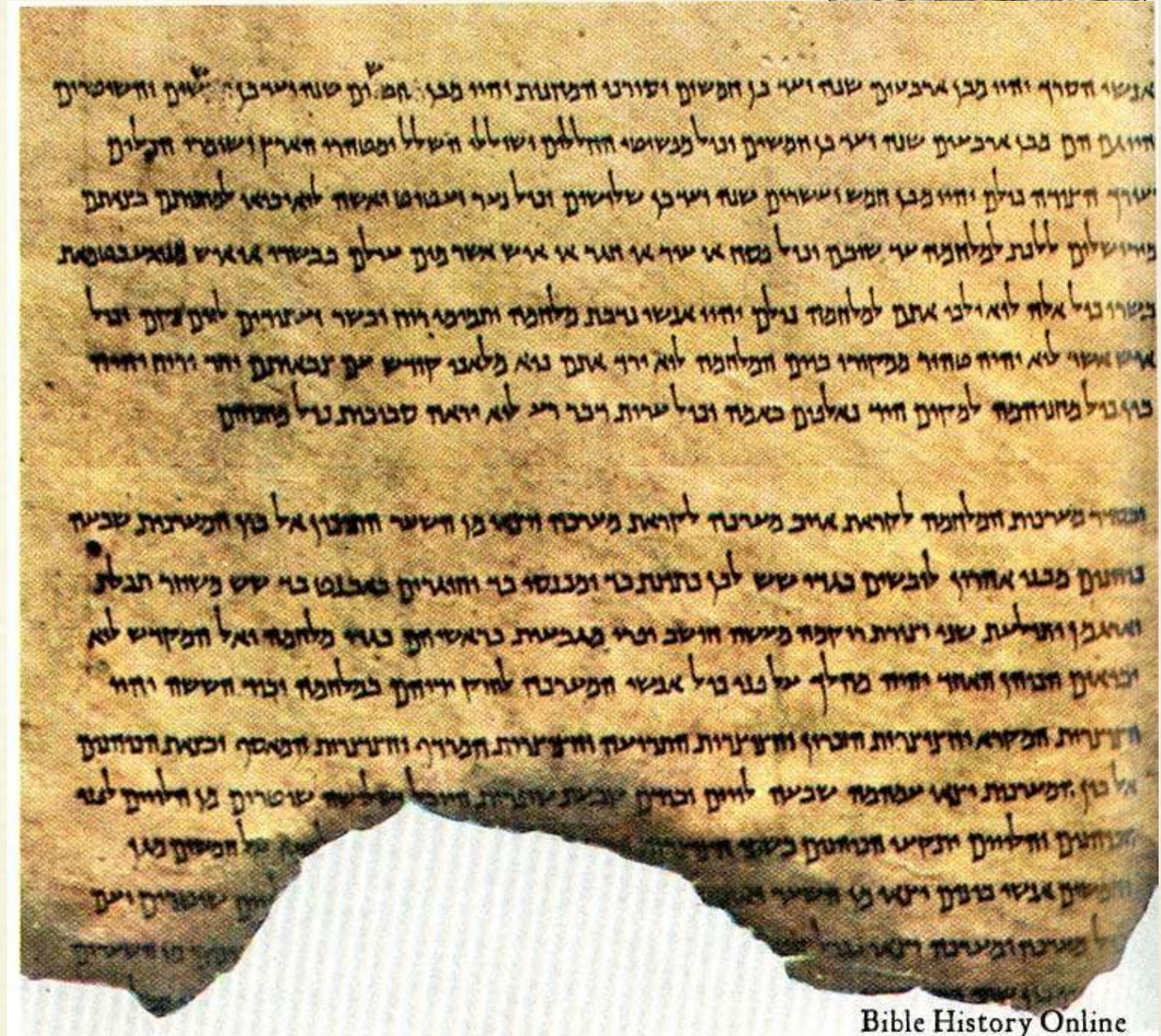
Bible History Online